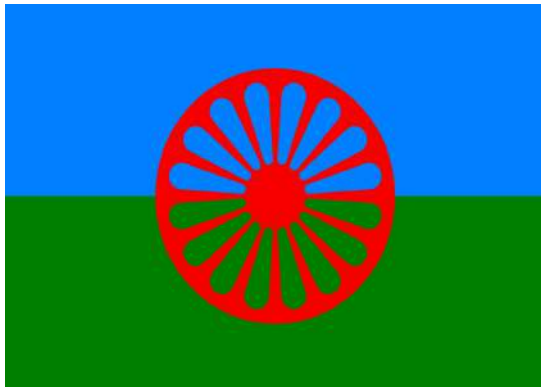
Flag of the Gitanos.

Technically, in a formal system, travelling people who come to some recycling centers, can ask to see what is being thrown away to salvage it, which can be of interest.